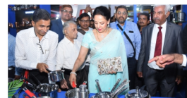
Member of Parliament & Actress - Smt. Hema Malini