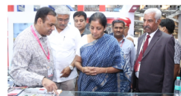
Hon'ble Former Commerce Minister of India - Smt. Nirmla Sitharaman