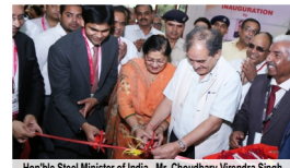
Hon'ble Steel Minister of India - Mr. Choudhary Virendra Singh