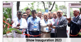
Show Inauguration 2023

Glimpse of Previous Shows - Indian Stainless Steel Houseware Show & Indian S. S. Pipe Expo