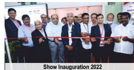
Show Inauguration 2022